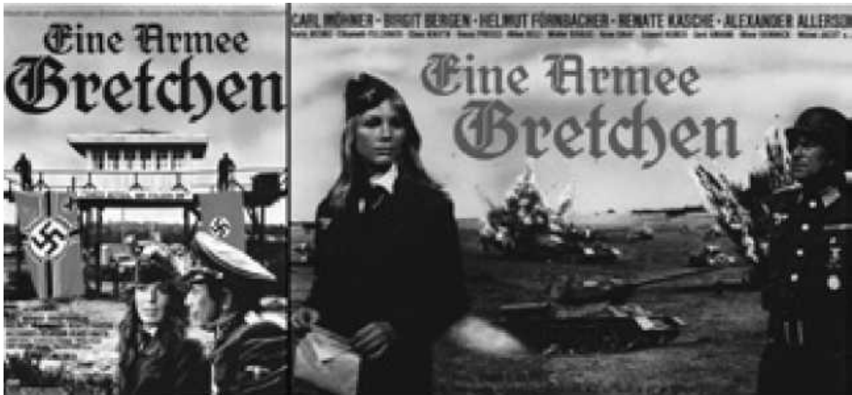
Figure 8.1 Marketing posters for Erwin C. Dietrich's Eine Armee Gretchen (1972) in German-speaking countries.

Dietrich had unscrupulously overstepped accepted mainstream marketing standards in the promotion of other sex films in his repertoire indicates that he deliberately chose to show discretion in promoting EAG .