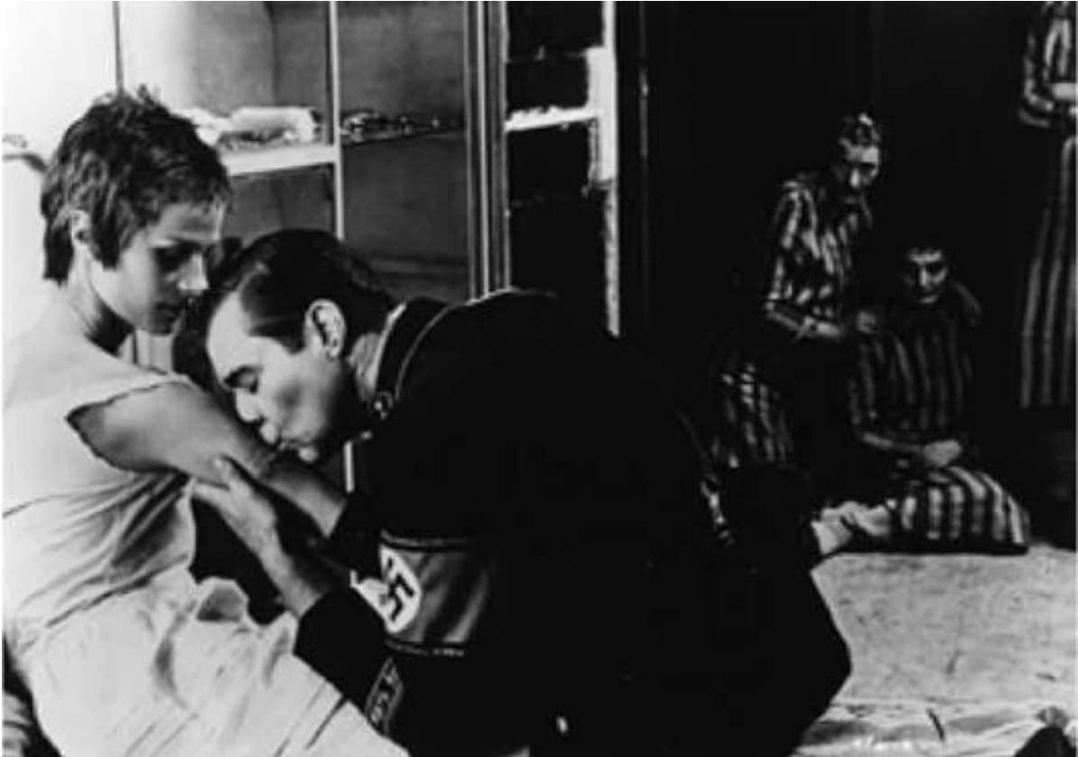
Figure 9 A flashback from Liliana Cavani's The Night Porter (1974) in which Max Altdorfer (Dirk Bogarde) 'examines' Lucia Atherton (Charlotte Rampling) as female prisoners observe. Here Cavani visualizes the eros of power and terror, as well as their voyeuristic appeal.

The viewer sees no sexual intercourse between Max and Lucia during the camp period. However, the director alludes to oral sex, bondage and domination, and these acts and the victims' suffering appear to give sexual pleasure to the perpetrator. In another memory of Lucia, Max 'doctors' her.