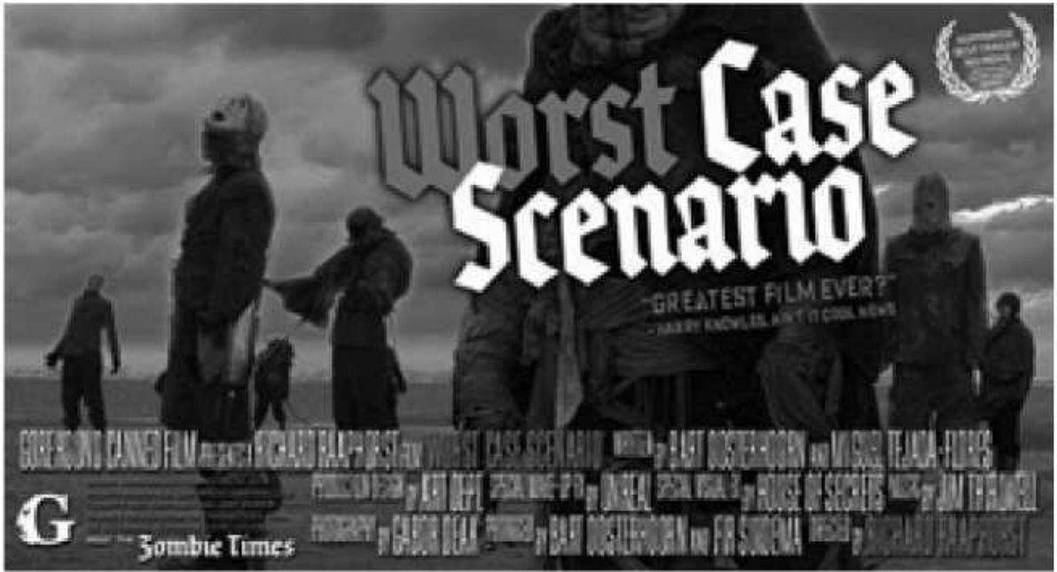
Figure 5.2 A poster for the now abandoned Worst Case Scenario film project, to have been directed by Richard Raaphorst.

technology to put it on film’. 42 In other words, a secret weapon that just might win the war.