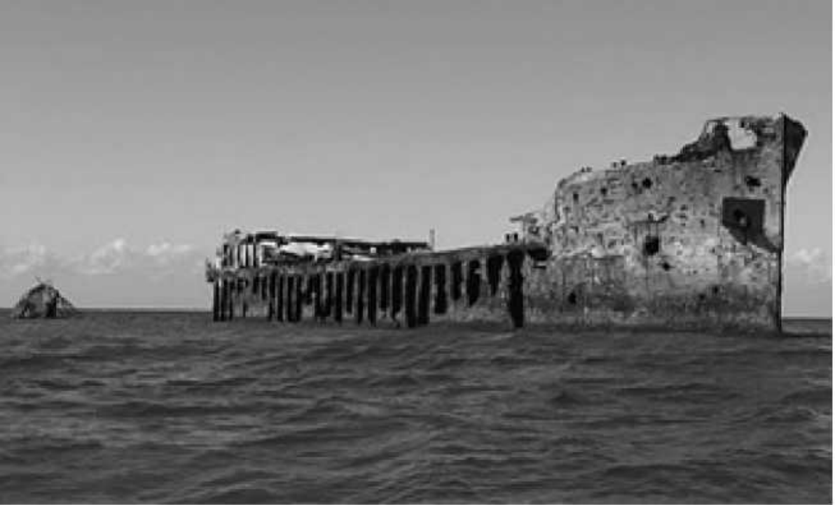
Figure 5.1 The concrete ship Saponara off the Bimini Island group, used to excellent effect in Shock Waves (1977).