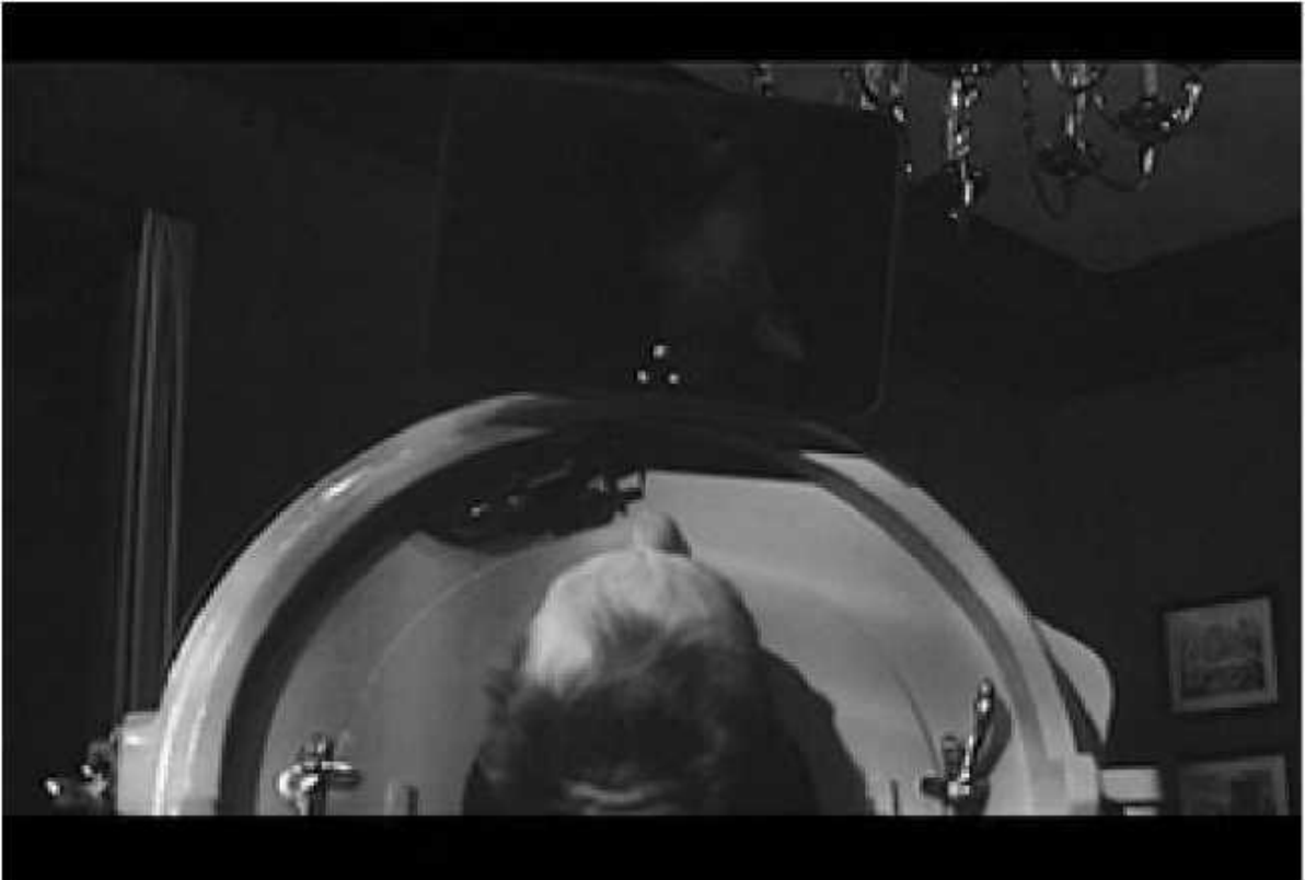
Figure 7.1 Klaus (Gunter Meisner), a former Nazi death camp doctor now confined to an iron lung after a suicide attempt in Agustin Villaronga's A Glass Cage (1986).