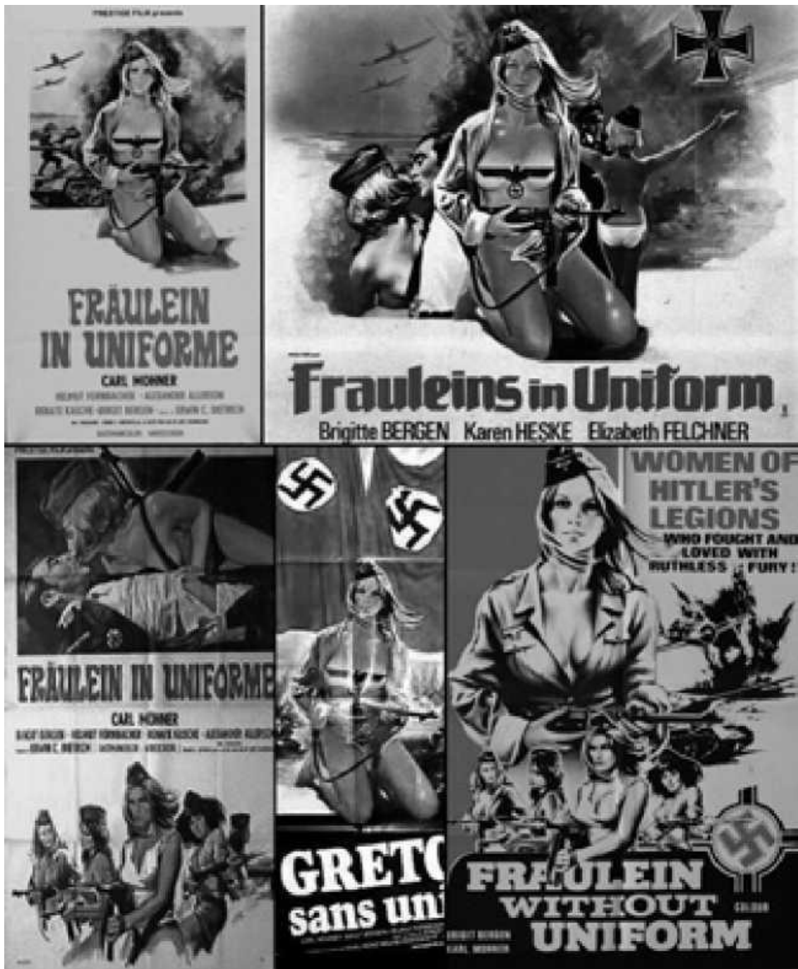
Figure 8.2 Marketing posters for Erwin C. Dietrich's Eine Armee Gretchen (1972) in non-German speaking countries.