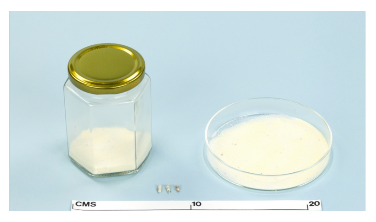
A cache of chemicals was discovered at Graham's home