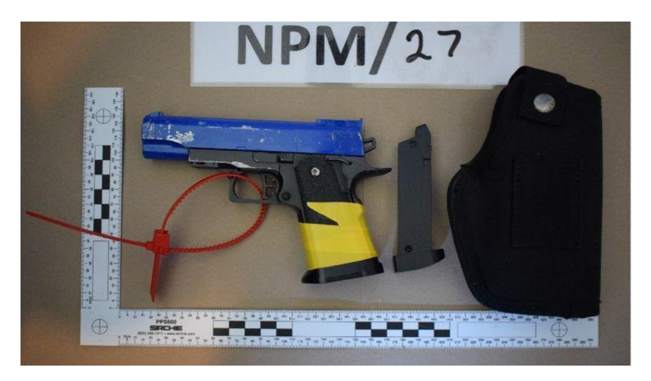
Police found an array of items designed to cause harm