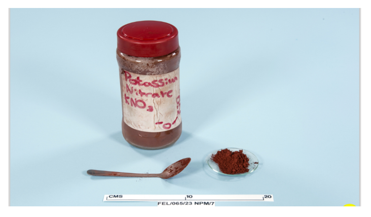
He conducted experiments in his back garden