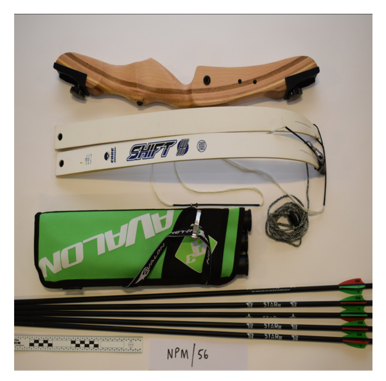
Weapons found in Graham's possession