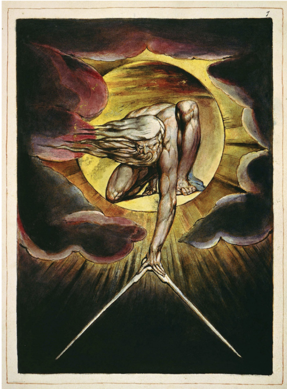
Fig 2. The compass is associated with power (in a geometrically gendered arrangement) by William Blake in Europe: A Prophecy (1794) — ‘When he sets a compass upon the face of the deep’ (Proverbs 8: 27) [Public domain], via Wikimedia Commons, https://commons.wikimedia.org/wiki/File:Europe_a_Prophecy_copy_K_plate_01.jpg