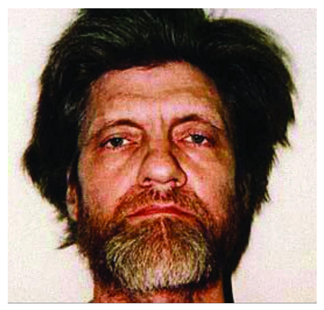
Kaczynski died at in a US federal prison medical centre in Butner, North Carolina