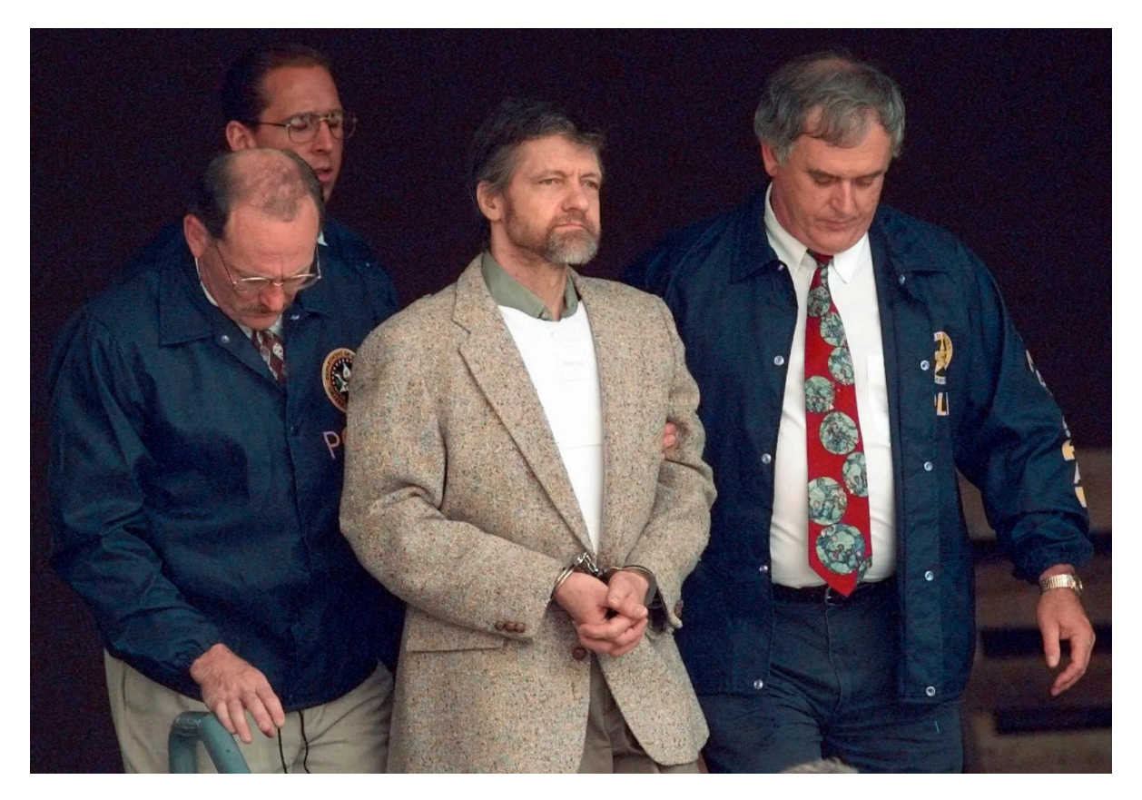
Kaczynski taken down the steps at the federal courthouse in 1996, in Helena, Montana